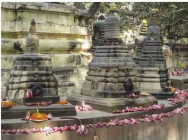
Flower Offerings , Bodhgaya