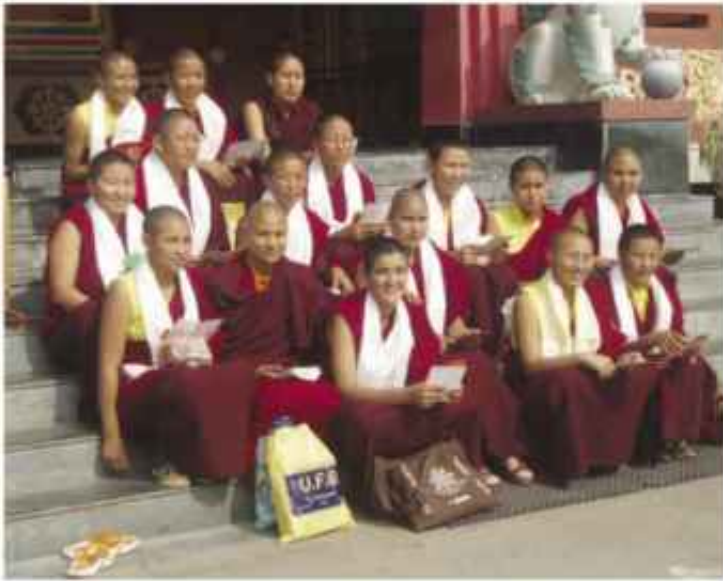
Outside Thrangu Rinpoche Monastery

We spent two days in Shravasti. We stayed there at a Korean Temple. It was very nice and extraordinarily clean. There was plenty of water, both hot and cold for washing and drinking. We cooked dinner and breakfast ourselves.