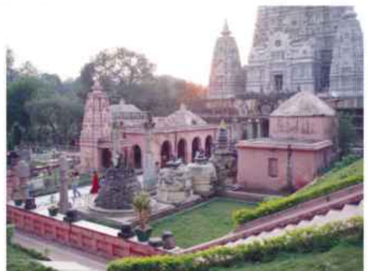
Entrance to Temple, Bodhgaya